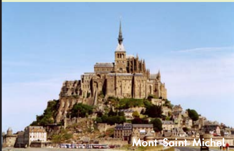
Mont Saint Michel