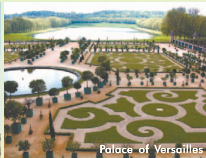
Palace of Versailles