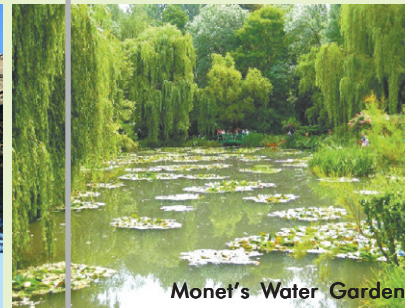
Monet's Water Garden