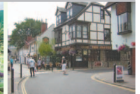
Sister City Christchurch, Dorset, UK