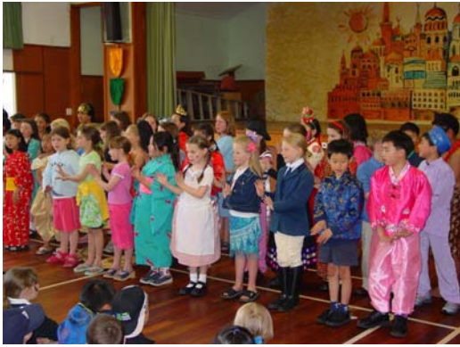
Merrin Primary School's multi-cultural choir.