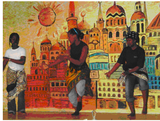
'Mafikizolo' Zimbabwean Dancers.